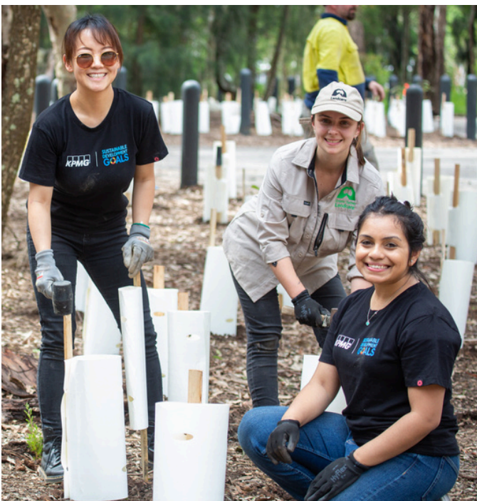
KPMG corporate volunteers planting with Greater Sydney Landcare at Nurranginy Reserve.

GSL believes that corporate engagement can help us deliver on-ground environmental restoration activities to improve habitats, increase biodiversity, and care for natural areas in Greater Sydney.