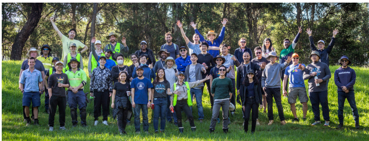
Atlassian's corporate volunteering day with Greater Sydney Landcare, tree planting in the Cumberland LGA.