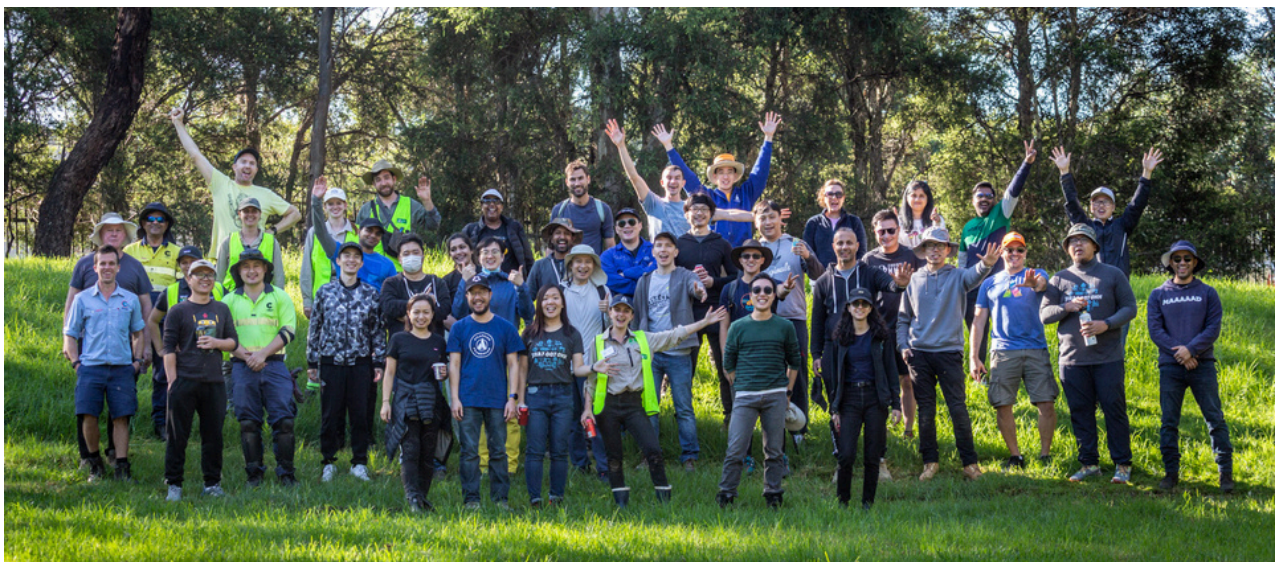
Volunteers at a Creating Canopies tree planting event.